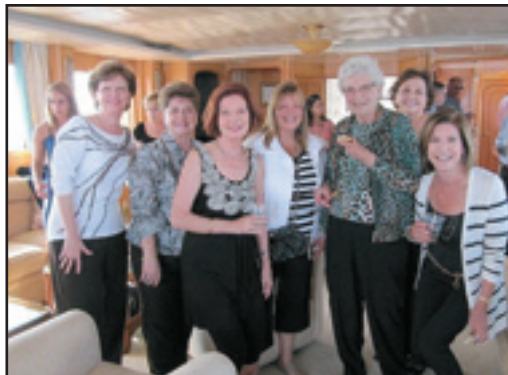
Fleet Cruise to The River Club